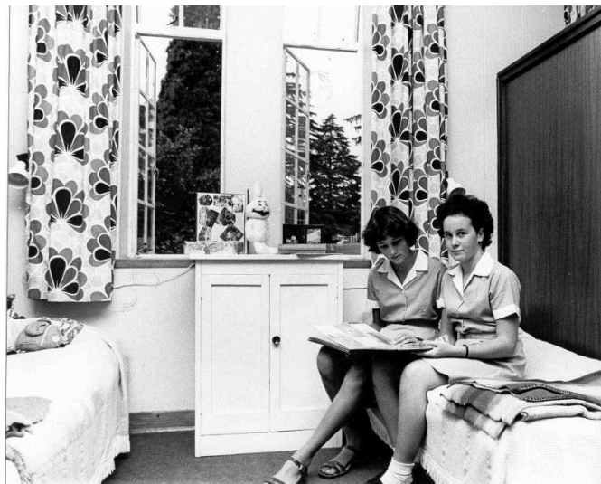
An Usherwood cubicle in 1977.

At last, in October 1975, the girls from Usherwood were able to move into a new home. On 5 March 1977 a service of thanksgiving was held in the Chapel and this was followed by a procession to the new Usherwood House for the blessing of the buildings.